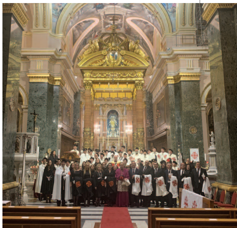
The Vigil and the Investiture Ceremony of the Maltese Lieutenancy took place respectively in the Basilica of the Nativity of Mary in Senglea (in our photo) and in the Metropolitan Cathedral of St. Paul in Mdina.