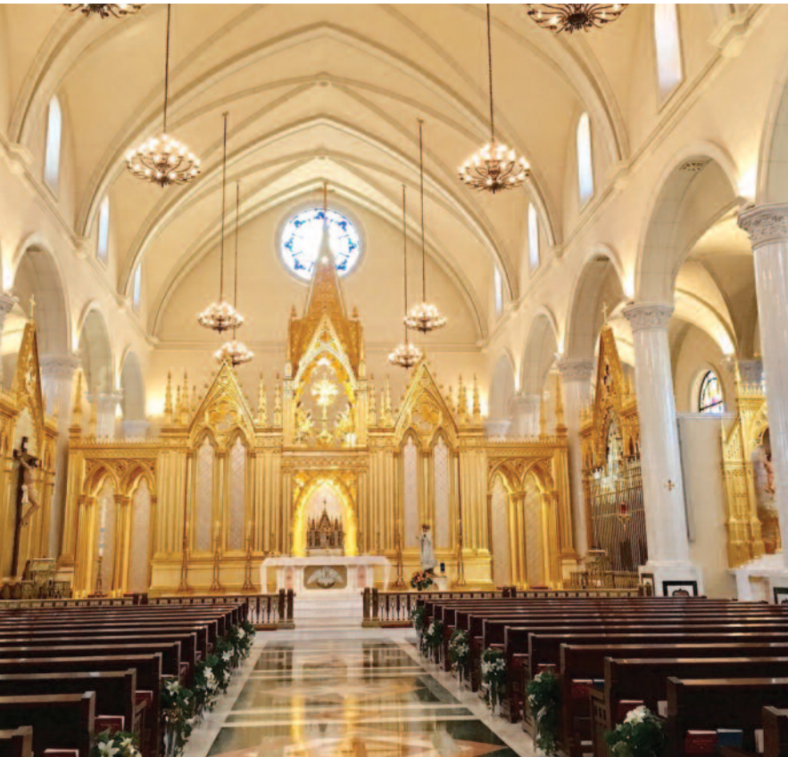
Members from all over North America participated in a pilgrimage dedicated to Our Lady of Palestine at the Shrine of the Blessed Sacrament founded by Mother Angelica in Hanceville, Alabama.