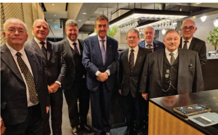
The Lieutenants and Magistral Delegates from the English-speaking countries (England and Wales, Scotland, Ireland, Gibraltar and Southern Africa) met with the Governor General in London on the side-lines of the Investiture ceremonies.