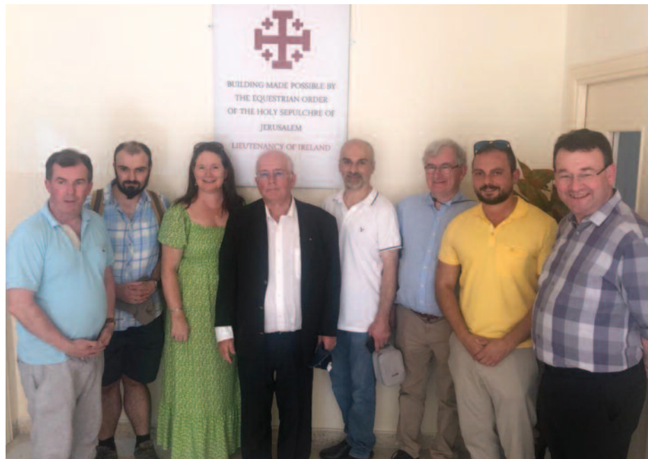
The pilgrimage of the Irish Knights and Dames included a visit to the parishes of Taybeh in Palestine and Mafraq in Jordan, where the Order's Lieutenancy for Ireland funded small projects, developing a bond of friendship with the local communities.

In Taybeh, the last remaining entirely Christian town in Palestine, we visited the Beit Afram Home for the Elderly, managed by the Servants of the Lord and the Virgin of Matara. Our Lieutenancy donated a substantial sum to finance urgently needed