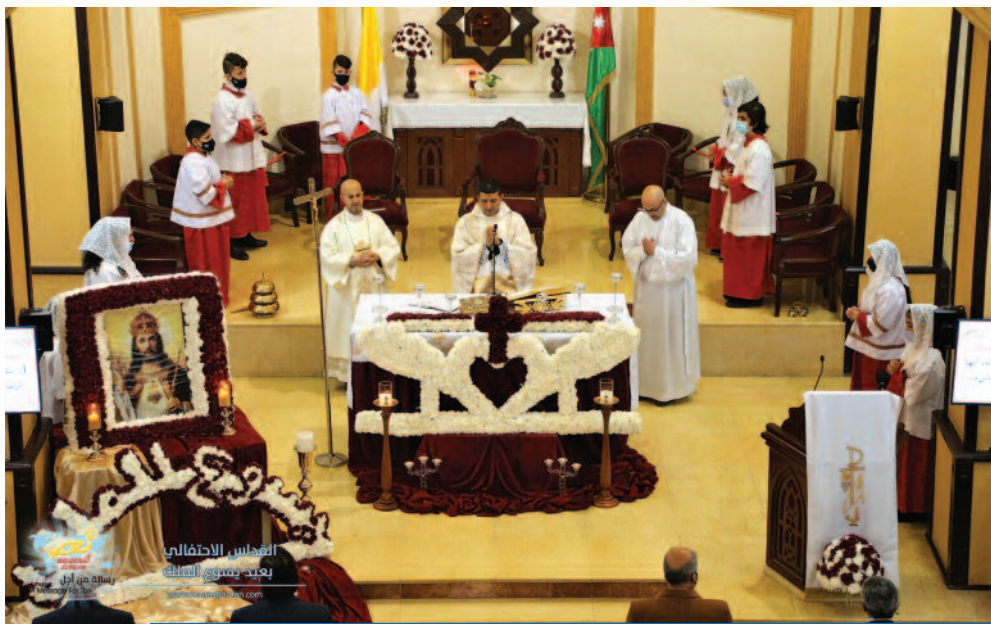
In Misdar, one of the poorest districts of Amman, Jordan, the parish has grown considerably over the years. The Order has taken over the work in the Church of Christ the King.

Patriarchate was able to create a pastoral environment suitable for living, praying and participating in masses and parish events.