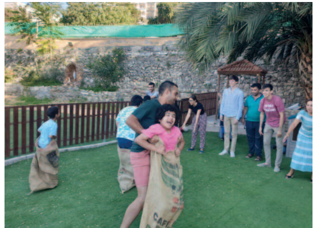
Young people organised by the Lieutenancy for Western Spain were able to take part in several services in the Holy Land, particularly with disabled children.

The young people divided into groups had the opportunity to experience diverse forms of service: some helped the Sisters of the Incarnate Word who work at the Hogar Niño Dios and prepared spaces in another house in Beit Sahour to welcome older children with disabilities for whom the best solution is to have their own environment and not in close contact with the younger children welcomed in Bethlehem. Another group served at the Crèche run by the Daughters of Charity of St Vincent de Paul