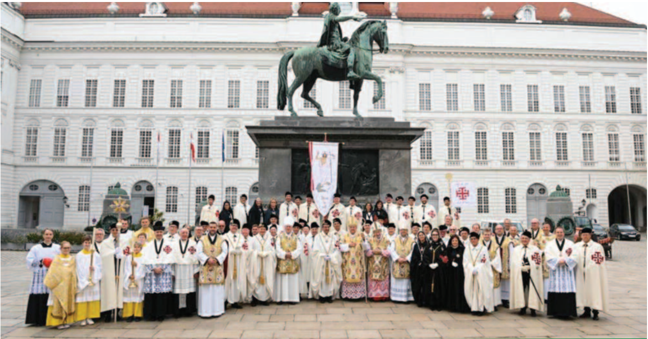
Numerous Lieutenancies were present at the Investiture ceremonies in Vienna.

dinner following the Investiture in Vienna, the Governor General recommended to those present to strengthen the Order's unity while respecting the diversity of traditions. The new Ritual, the commitment to greater spiritual involvement, the generosity towards the Mother Church of Jerusalem, must be shared by all the Lieutenancies, aware that together they