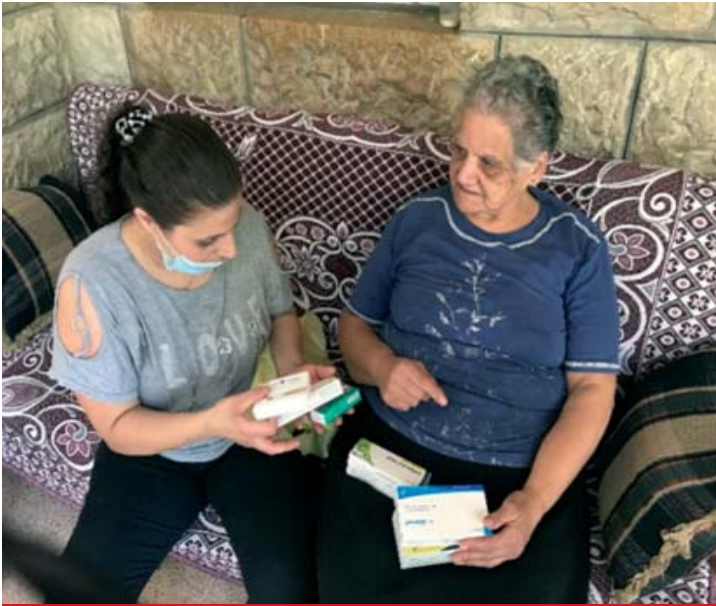
Support for people in need in the Holy Land is the Order's priority, especially with regard to access to medicines and health services during the pandemic.

attend because of a meeting with the President of the State of Israel, sent a message. The other members of the Grand Magisterium were connected online.