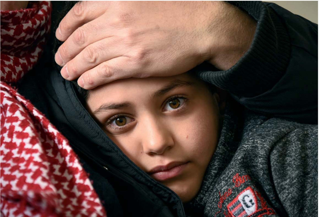
Iraqi Christian refugees in Jordan, a country within the territory of the Latin Patriarchate of Jerusalem, have been able to count on the help of the Order of the Holy Sepulchre for several years.

of the Latin Patriarchate in Jordan. Since 2014, the advance of armed groups and ISIS violence have forced even more people, especially minorities, to flee Iraq in an attempt to save their lives.