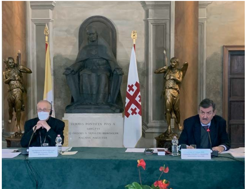
The Grand Master and the Governor General of the Order at the Spring meeting of the Grand Magisterium last April 15.