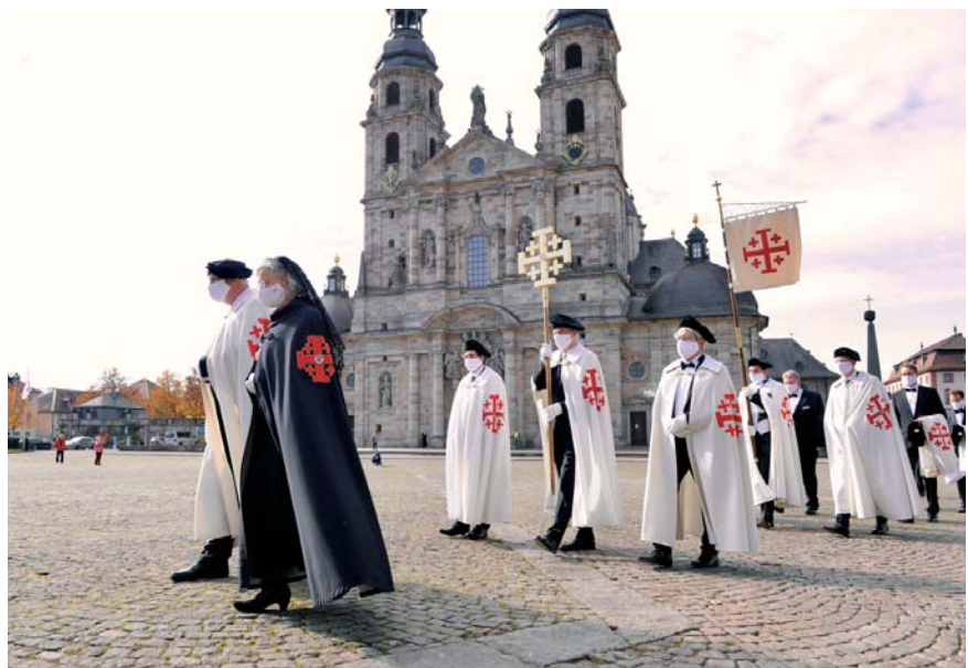
Procession on the occasion of the Investiture ceremony in Fulda, September 2020.