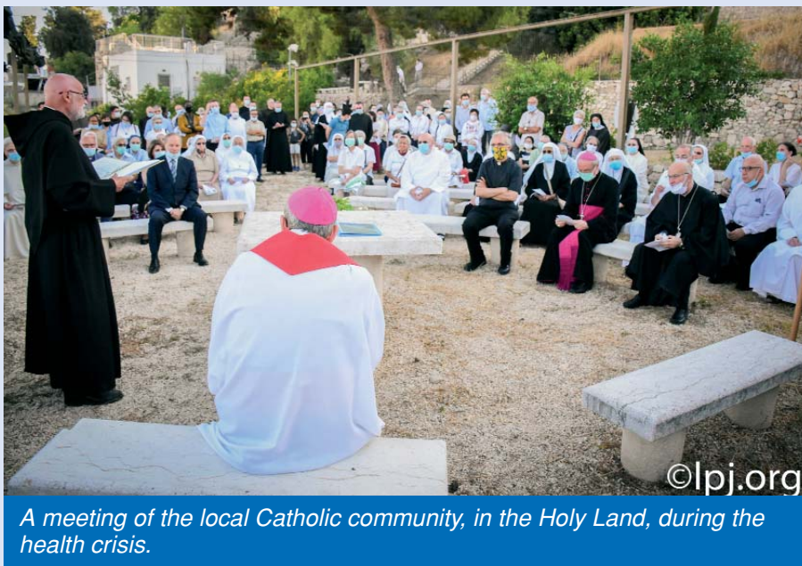
A meeting of the local Catholic community, in the Holy Land, during the health crisis.

"We are grateful that the special aid sent to the Covid-19 Fund did not substitute the regular commitment of our members in contributing to the daily life of the diocese of Jerusalem, but rather was added to it," concluded Governor General Leonardo Visconti di Modrone.