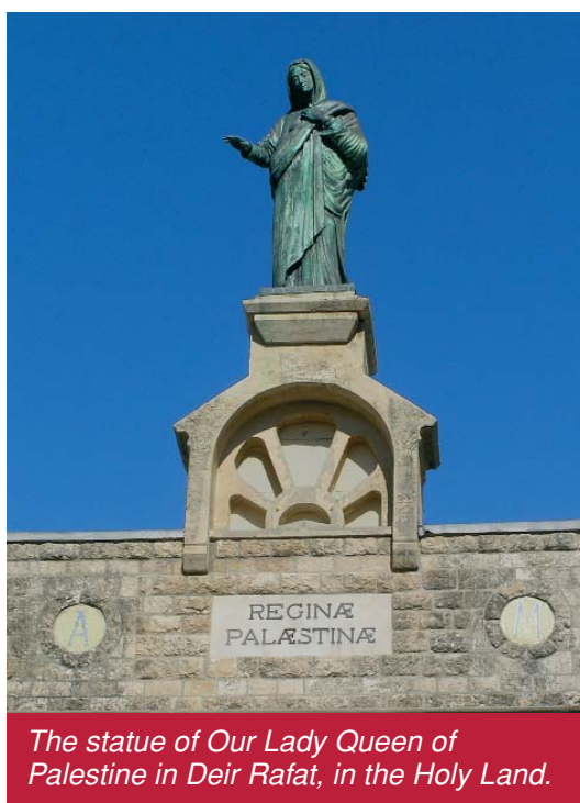
The statue of Our Lady Queen of Palestine in Deir Rafat, in the Holy Land.

Mother of the Encounter, Mary does not fear diversity or new paths. Indeed, she herself opens them up to us. In her arms we rediscover closeness to each other, we rediscover