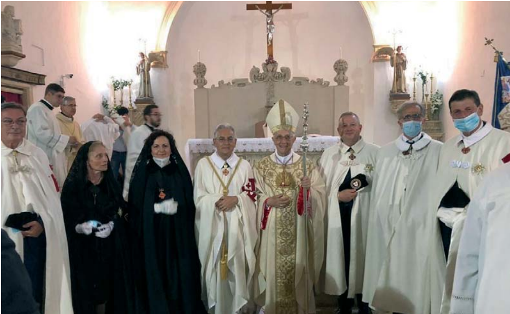
Eucharistic celebration presided over by Cardinal Fernando Filoni on the occasion of the 50 th anniversary of his ordination to the priesthood.