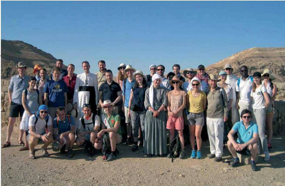
The question of welcoming young people into the Order is addressed by the Grand Master in an article published in May 2020 on the official website of the Grand Magisterium (our photo: young pilgrims from the Lieutenancy of France in the Holy Land).

to the Grand Master, to the address fcf@oessh.va or by post to the address of the Grand Magisterium (OESSH-00120 Vatican). "To communicate is to get involved, to dialogue is to get to know each other, to talk is to grow in mutual respect," concludes the cardinal. Various responses of the cardinal have already been published online, one regarding the Investiture ceremony, the other on interest in politics in the Holy Land and, one last, published in May, on the place of young people in the Order.