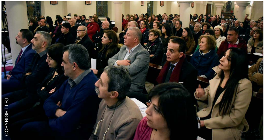
The parish community of Beit Sahour during a mass, before the ban on officiating celebrations due to the pandemic.

(around 250) were able to receive Communion during those four days".