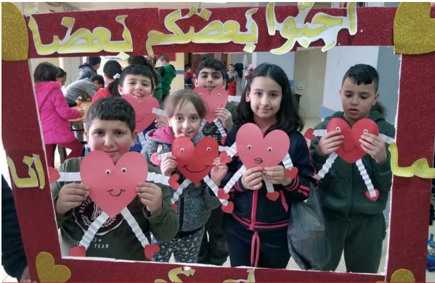
Assistance to education in the Holy Land is a priority for the Order now more than ever.

by the Grand Master, the wish for a productive meeting in the Autumn was expressed.