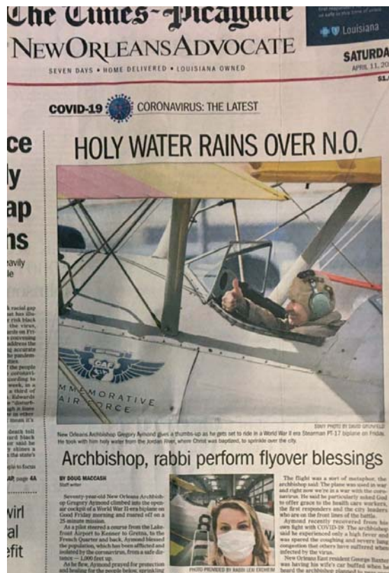
The New Orleans Times-Picayune newspaper – well known nationally in the United States – mentioned the “flying blessing” given by the Grand Prior of the Southeastern US Lieutenancy during the toughest period of the pandemic.